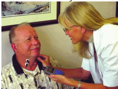
Figure 1. Speech therapist using electrical stimulation for patient with dysphagia.

The Therapist's Process - 1. The therapist completes a functional assessment and a thorough patient history. 2. A modified barium study (MBS) should be performed before starting electrical stimulation to document the type and amount of aspiration the patient is experiencing. 3. To apply electrical stimulation, the patient's skin must be clean and dry (men must be clean-shaven). 4. The electrodes are firmly attached to ensure proper adhesion (see Figure 1 ).